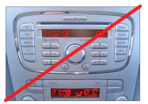
Oval shaped Ford OEM head unit