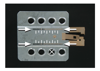
The position of the copper coloured holder can be adjusted to your needs for perfect fit. (see sample)