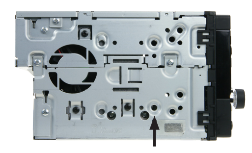
Mount the metal brackets with the double DIN head unit

Please use our part-no.: CAW 2114-19-B (black) CAW 2114-19-S (silver) instead